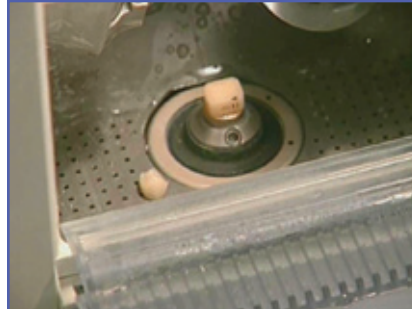
CAD/CAM milling machine