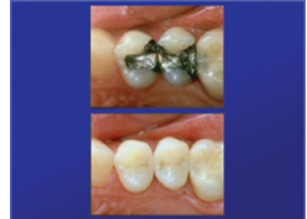
Results in one appointment